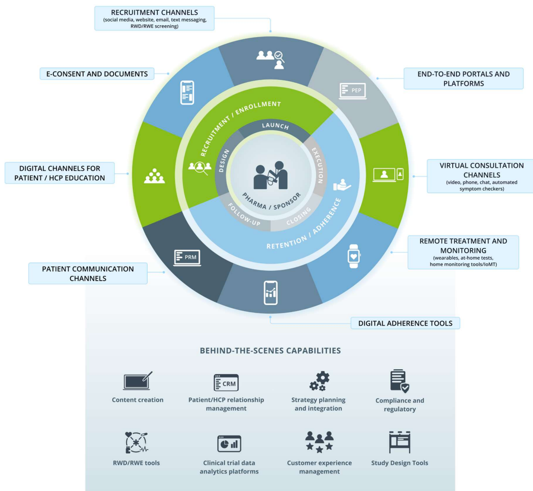
Figure 2: Digital capabilities for clinical trials

To be approved for market, drug candidates must be tested in three phases. Phase I trials test for safety on healthy people; Phase II trials test for efficacy on small patient cohorts; and Phase III trials test larger patient cohorts. Each trial proceeds in five stages: 1) design (defining participant inclusion/exclusion criteria, endpoints, and biomarkers); 2) launch (selecting the site and identifying, recruiting, and enrolling potential participants); 3) execution (treating and monitoring patients); 4) closing (analyzing the data and submitting reports on safety and efficacy outcomes); and 5) follow-up (supporting patients post-trial and assessing the longer-term effect of therapeutics) (see Figure 2). Several types of digital capabilities can support patient touchpoints in all stages. Clinical trial organizations should focus on on-stage capabilities for processes that directly affect patients, including recruitment and retention, and behind-the-scenes capabilities for those that do not need a direct patient interface.